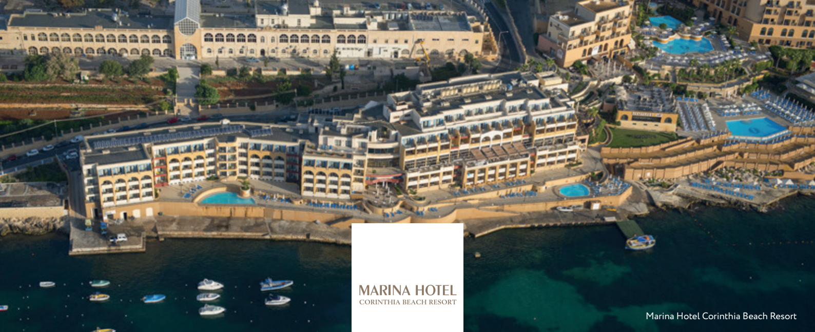
MARINA HOTEL CORINTHIA BEACH RESORT