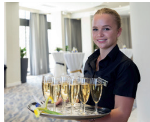
Arrive in Style