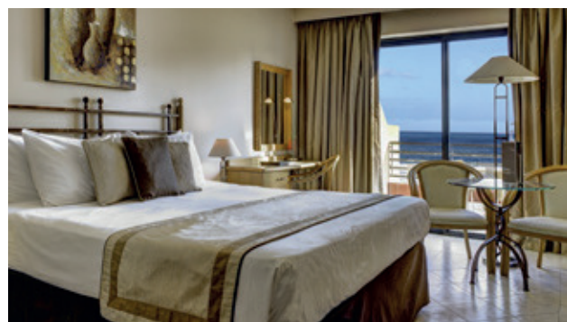
Superior Seaview Room

189 BEDROOMS 11 SUITES 3 MEETING ROOMS 120 CAPACITY THEATRE STYLE IN MAIN MEETING ROOM